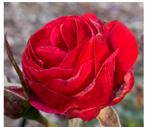
A rose in full bloom on 9 November 2020 in our Rose Garden

But, as I strolled through our Gardens last week, I reflected on how resilient plants are (roses in glorious bloom in early November?!). And we will be resilient too. We will focus on the good and be hopeful. For instance, we were able to have a few very small outdoor weddings in the autumn with social distancing. Through your generous support we were able to keep our staff and students working throughout the growing season! We were able to host our first ever virtual plant sale this fall: our Fifth Annual Houseplant and Succulent Sale. We took online orders the first two weeks of October and customers scheduled pickup times during the third week of October. We learned a lot about this type of sale and plan to offer our Spring Plant Sale in a similar manner, but hopefully with a different online shopping system for a better customer experience.