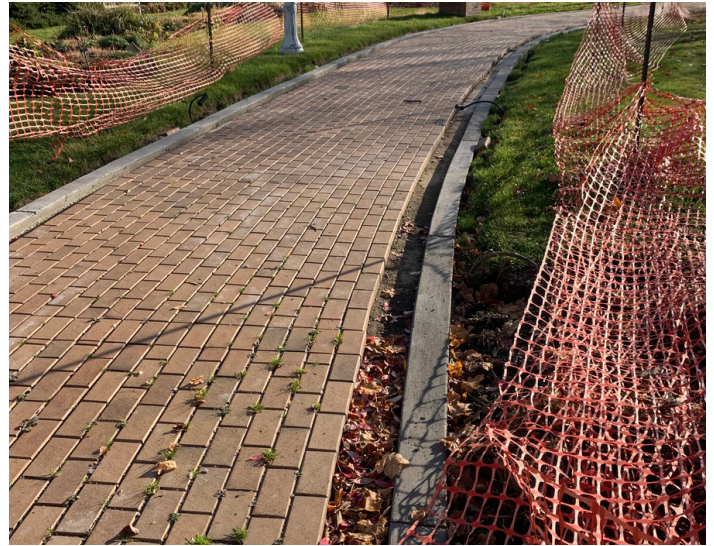
In the Judith A. Delapa Perennial Gardens, outer bricks 'rolling', causing a significant trip hazard (left) are being repaired with concrete curbs that will prevent the outer bricks from moving (right).